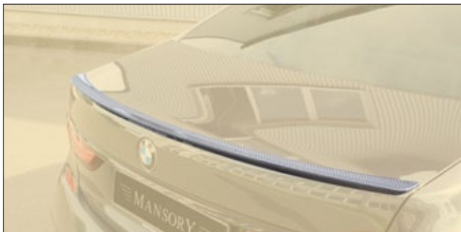
Rear decklid spoiler - carbon 717 830 841