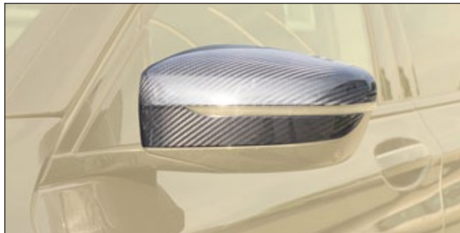
Carbon mirror cover 717 522 201