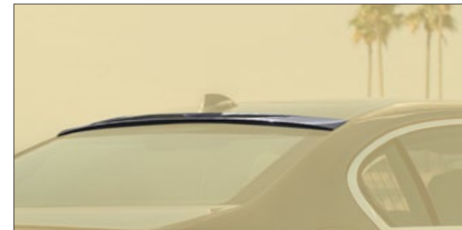
Roof spoiler - carbon 717 630 751