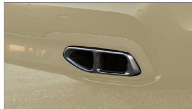
Exhaust tip Black Chrome

❗ compatible only with M Sportpaket / M Performance