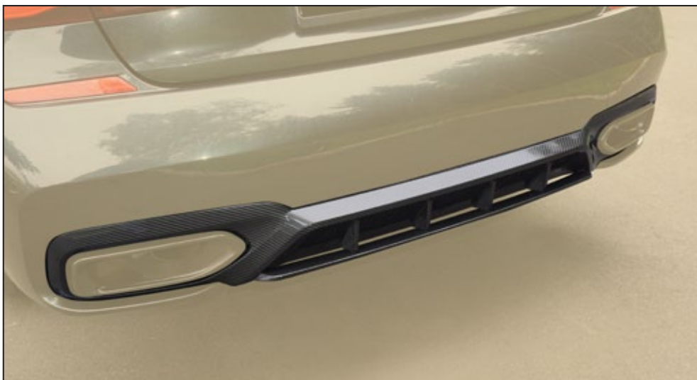
Rear diffuser with diffuser board 717 802 991